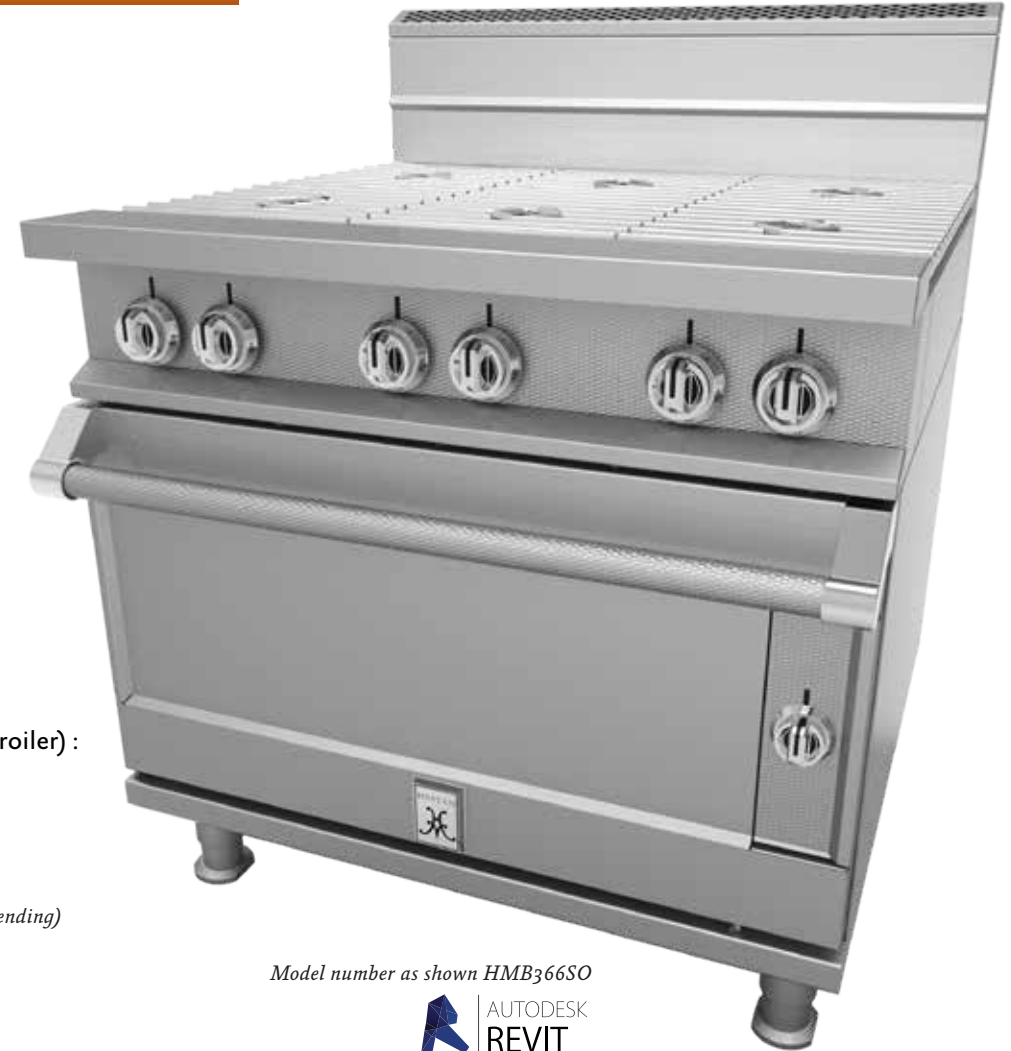
Model number as shown HMB366SO