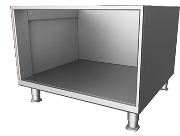
36" Cabinet Base