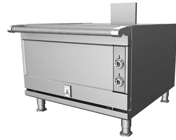
36" Standard or Convection Oven