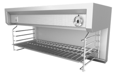
36" Cheesemelter- Wall Mount