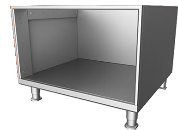
36" Cabinet Base