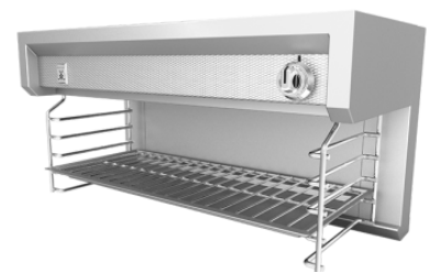
36" Cheesemelter- Wall Mount