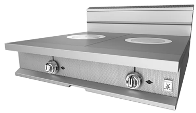
36" French Top Rangetop