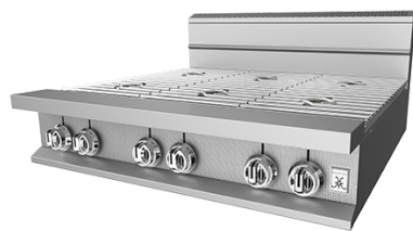
36" Sealed OR Open Burner Rangetop