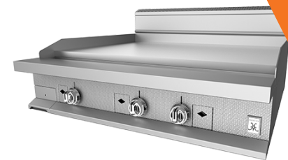
36" Thermostatic OR Manual Griddle Rangetop