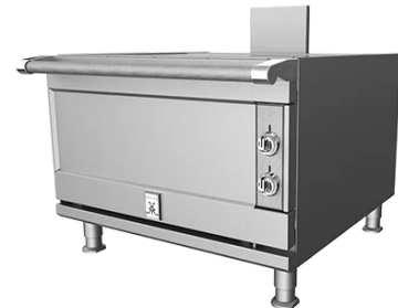
36" Standard or Convection Oven