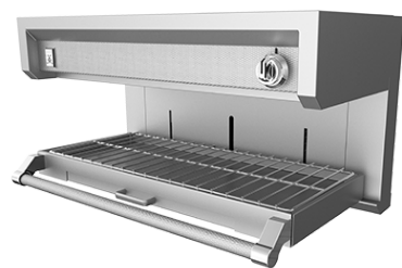
36" Salamander- Wall Mount